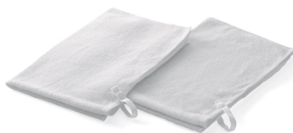
#2999 Bamboo Prep Towels (set of 2) $17.50