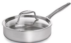
#2890 Stainless Cookware - 10" Covered Skillet $160.00