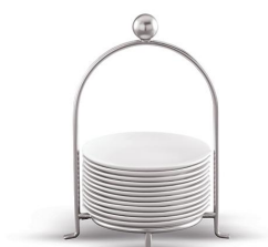
#3080 Simple Additions® Appetizer Plates & Caddy Set $65.00