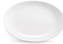
#3085 Simple Additions® Oval Platter $20.00