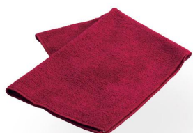
#2981 Microfiber Towel - Cranberry $8.50