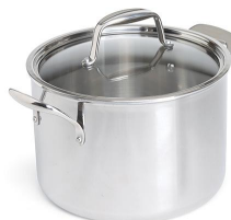
#2894 Stainless Cookware - 8-qt. Covered Stockpot $225.00