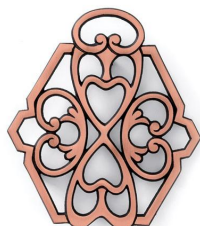
#2946 Round-Up from the Heart® 2011 Trivet $13.00