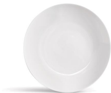
#3061 Simple Additions® Appetizer Plates (set of 4) $20.00