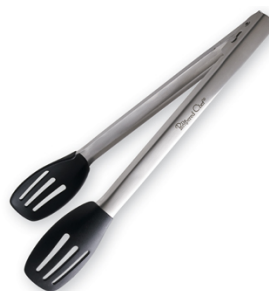
#2955 Chef's Tongs $22.00