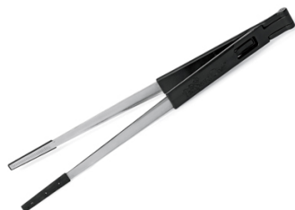
#2956 Sauté Tongs $22.00