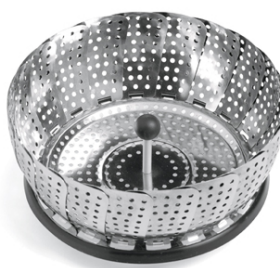
#2892 Stainless Steamer $16.50