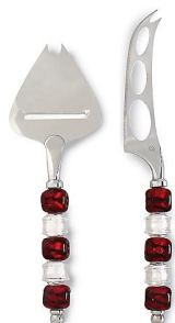
#2895 Beaded Cheese Bistro Set $32.00