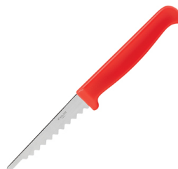
#2904 My Safe Cutter $4.00