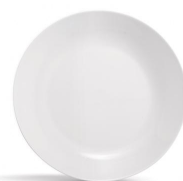
#3066 Simple Additions® Dinner Plates (set of 2) $24.00