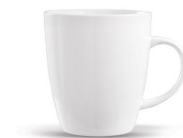
#3079 Simple Additions® Cups (set of 2) $18.00