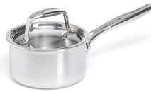
#5368 Stainless Cookware - 1.5 qt. Covered Saucepan $89.00