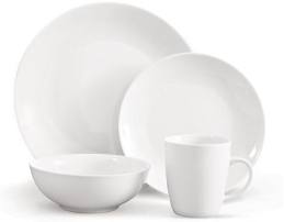
#3110 Simple Additions® 16-Piece Dinnerware Set $125.00