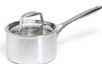
#2893 Stainless Cookware - 3-qt. Covered Saucepan $150.00